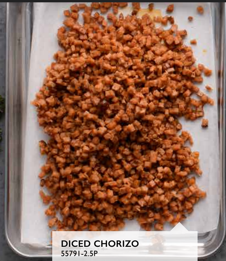
DICED CHORIZO 55791-2.5P Pack Size 2.5kg | Servings/Pack 50 Packs/Carton 8 Introduce the flavours of Spain to enhance your favourite dish including pasta, seafood and even wraps/burritos/tortillas, Ole!