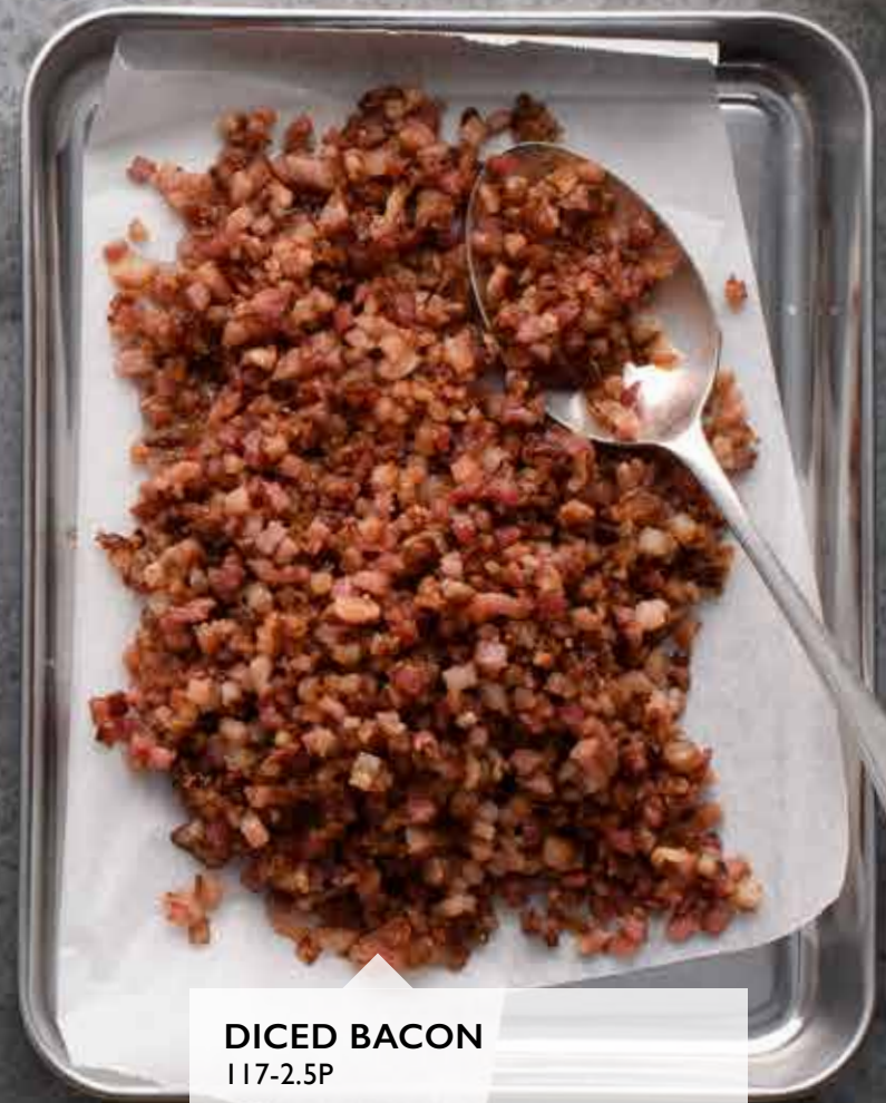
DICED BACON 117-2.5P Pack Size 2.5kg | Servings/Pack 50 Packs/Carton 8 Big flavour! Real bacon pieces smoked over real woodchips. Perfect in omelettes, savoury muffins or topped on pizza.