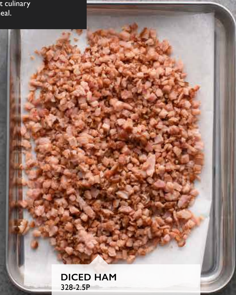
DICED HAM 328-2.5P Pack Size 2.5kg | Servings/Pack 50 Packs/Carton 8 Give ham a starring role in your kitchen, with its versatility you can enjoy it in fried rice, a quiche or even a refreshing salad.